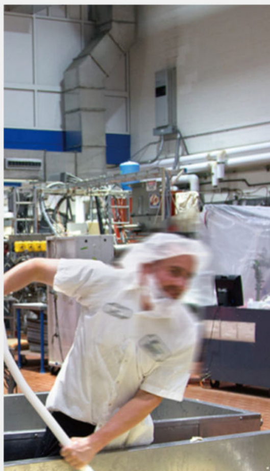
Food Processing Plant