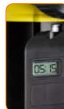
Digitalanzeige in Stunden und Minuten Digital display in hours and minutes