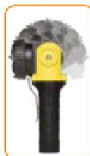
Leuchtenkopf 180° stufenlos verstellbar Lamp head 180° infinitely adjustable