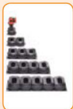
optional Multi charging units available